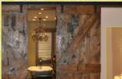
Hand-hewn Oak 80-100 years old from Tennessee